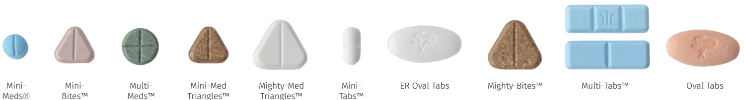
Tablets pictured are true to size

Our 503B drugs have expiration dates/BUDs up to a year determined through extensive stability testing.